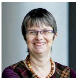
Molly Scott-Cato Green Party MEP for the South West

The EU is also about solidarity and collective action. It provides the opportunity to look beyond narrowly-defined national interests to work for progress on issues of common concern, which cannot be dealt with as effectively by countries acting alone. Compared to David Cameron, ours is a different view of Europe. We oppose many of the measures the UK Government wants for a new UK-EU settlement and its overall vision of what the Europe Union should be. We reject Cameron's 'best of both worlds' approach which wants the UK to only take from Europe and give nothing back.