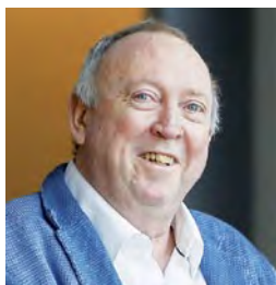
Keith Taylor Green Party MEP for the South East

We know the EU is far from perfect, just as with Westminster. We want to change Westminster's archaic unelected second chamber, undemocratic voting system and its current austerity politics. So we also want change at EU level: more powers to the European Parliament in relation to the other EU institutions, primacy given to social and environmental standards, and stronger regulation of transnational big business, including the banks.