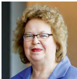
Jean Lambert Green Party MEP for London

Greens have a clear vision for Europe. The European Union should protect our rights, be a world-leader on the environment and tackling climate change, strongly regulate transnational big business, and be a force for peace and justice in the world.